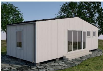
“1+1” Single module

The house to customers is delivered on the transport platform completely finished and packed. Installation of the house on the customer's site - 1 day (for one module house), 3 days (for 2 module house).