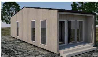
“1+1” 40 m2