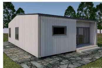
“1+1” 80 m2